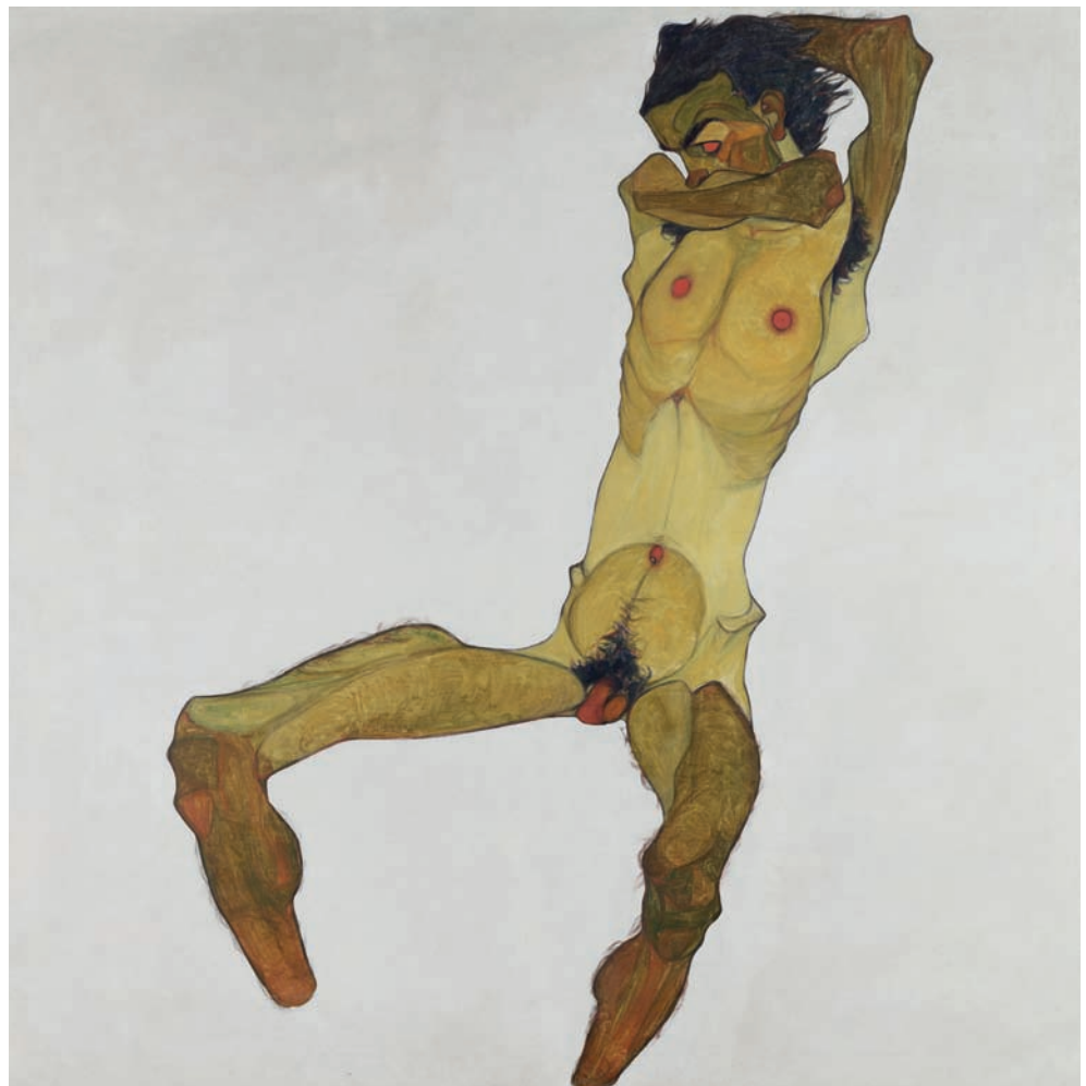
Egon Schiele, Seated Male Nude (Self-Portrait), 1910 Leopold Museum, Vienna, Inv. 465