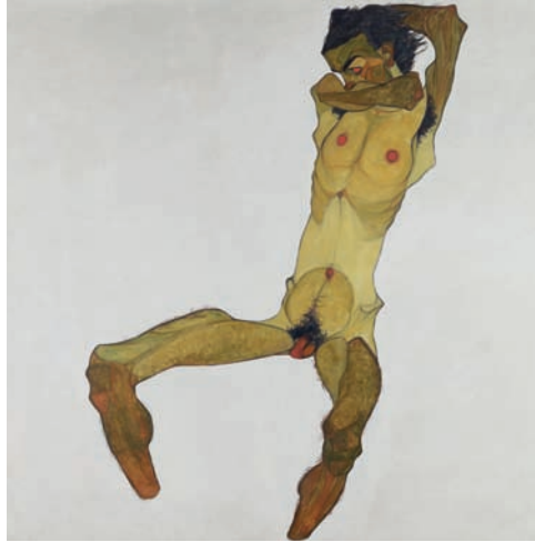
Egon Schiele, Seated Male Nude (Self-Portrait), 1910 Leopold Museum, Vienna, Inv. 465