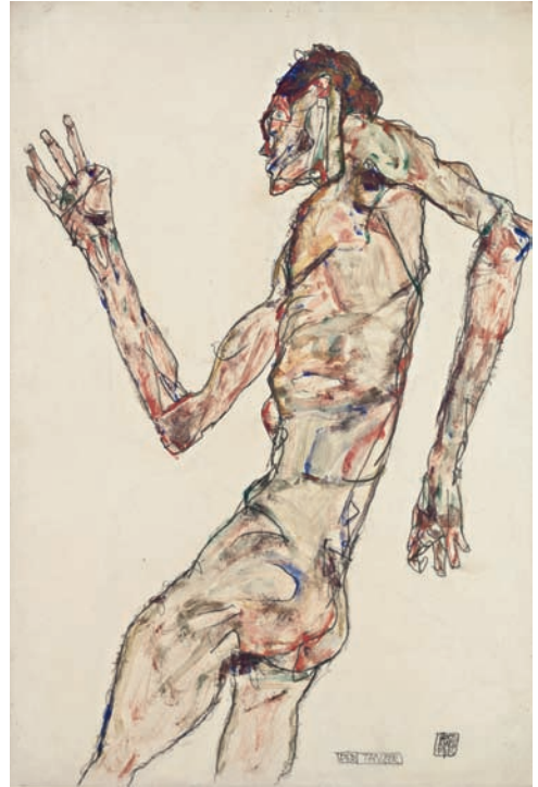
Egon Schiele, The Dancer, 1913 Leopold Museum, Vienna, Inv. 1434