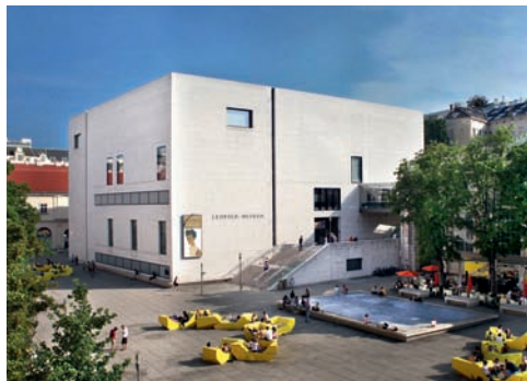
Leopold Museum, Vienna

On the occasion of its tenth anniversary, the Leopold Museum will dedicate its 2011 autumn exhibition to the oeuvre of Egon Schiele. The exhibition's title "Melancholy and Provocation" refers primarily to the early oeuvre of the artist who died in 1918 when only 28 years of age. For Schiele's early chief works, which he created from 1910 when he was only 20 years old, are characterized by a strong sense of melancholy and sadness, but also by his fascination with the unusual and the ecstatic. His first solo exhibition, held at the art salon