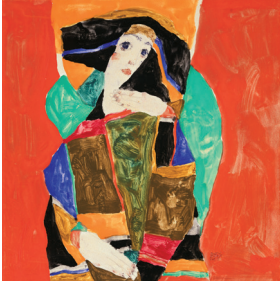
EGON SCHIELE PORTRAIT OF A LADY (WALLY NEUZIL), 1912