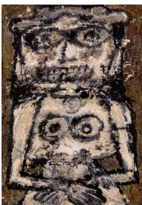
JEAN DUBUFFET Minerva, 1945

The Heidi Horten Collection includes some 300 paintings, graphic works, and sculptures by world-class international artists, which has resulted in a representational cross-section of art history from Modernity to the present.