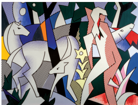
ROY LICHTENSTEIN Forest Scene, 1980

PRESS CONFERENCE: THURSDAY, FEBRUARY 15TH, 11 AM | LEVEL 4