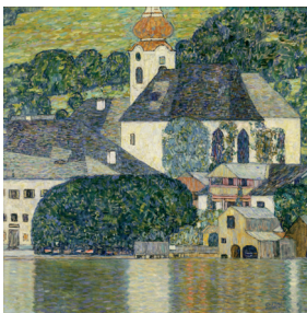
GUSTAV KLIMT Church in Unterach am Attersee, 1916