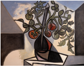
PABLO PICASSO PLANTE DE TOMATE, 1944