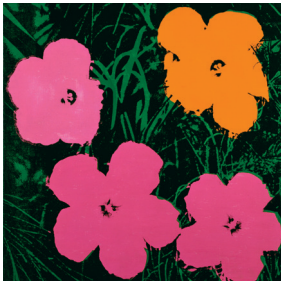
ANDY WARHOL Four-Foot Flowers, 1964

The exhibition “WOW! The Heidi Horten Collection” is the first public unveiling of one of Europe’s most sensational private art collections. Its presentation at the Leopold Museum fulfills the collector’s long-cherished wish to make the masterpieces she has carefully assembled since the 1990s, spanning from Gustav Klimt to Andy Warhol and Damien Hirst, available to a broad audience. The collector’s philanthropic dedication is further underscored by her support of educational programs to benefit children and adolescents, as well as weekly free admission to the museum for the general public.