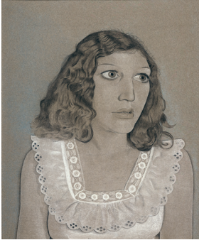
LUCIAN FREUD GIRL IN A WHITE DRESS, 1947 © Lucian Freud Archive