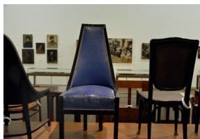
View of the exhibition