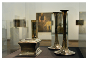
View of the exhibition