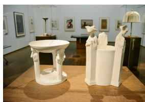
View of the exhibition