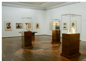
View of the exhibition

Press photographs may be used free of charge in the context of exhibition reports. The picture captions and corresponding copyright notices must be cited in full every time. No fees are payable for using the photographs as long as their use does not exceed a volume justified for information purposes.