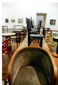
View of the exhibition