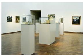
View of the exhibition