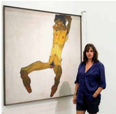
Tracey Emin in front of Egon Schieles painting »Seated Male Nude (Self-Portrait)« | 2014