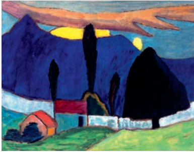
GABRIELE MÜNTER | 1877–1962