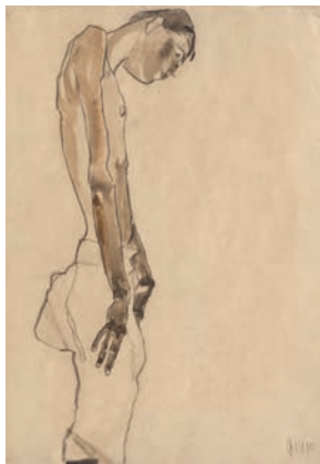
EGON SCHIELE | 1890–1918