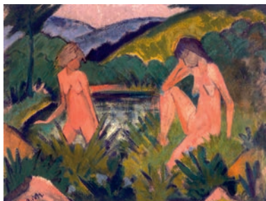
OTTO MUELLER | 1874–1930