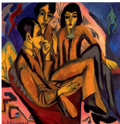
ERNST LUDWIG KIRCHNER | 1880–1938