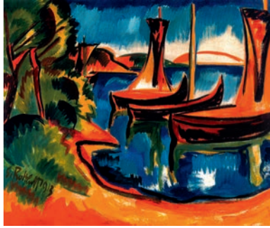
KARL SCHMIDT-ROTTLUFF | 1884–1976

Boats on the Water (Boats in the Harbor) | 1913