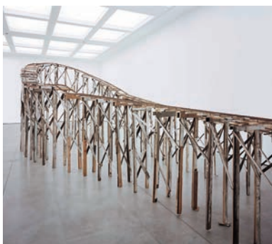
TRACEY EMIN | born in 1963, lives and works in Vienna