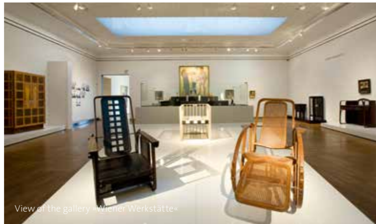
View of the gallery »Wiener Werkstätte«