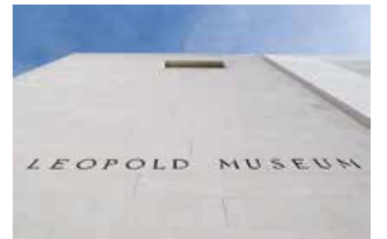
Facade of white shell limestone