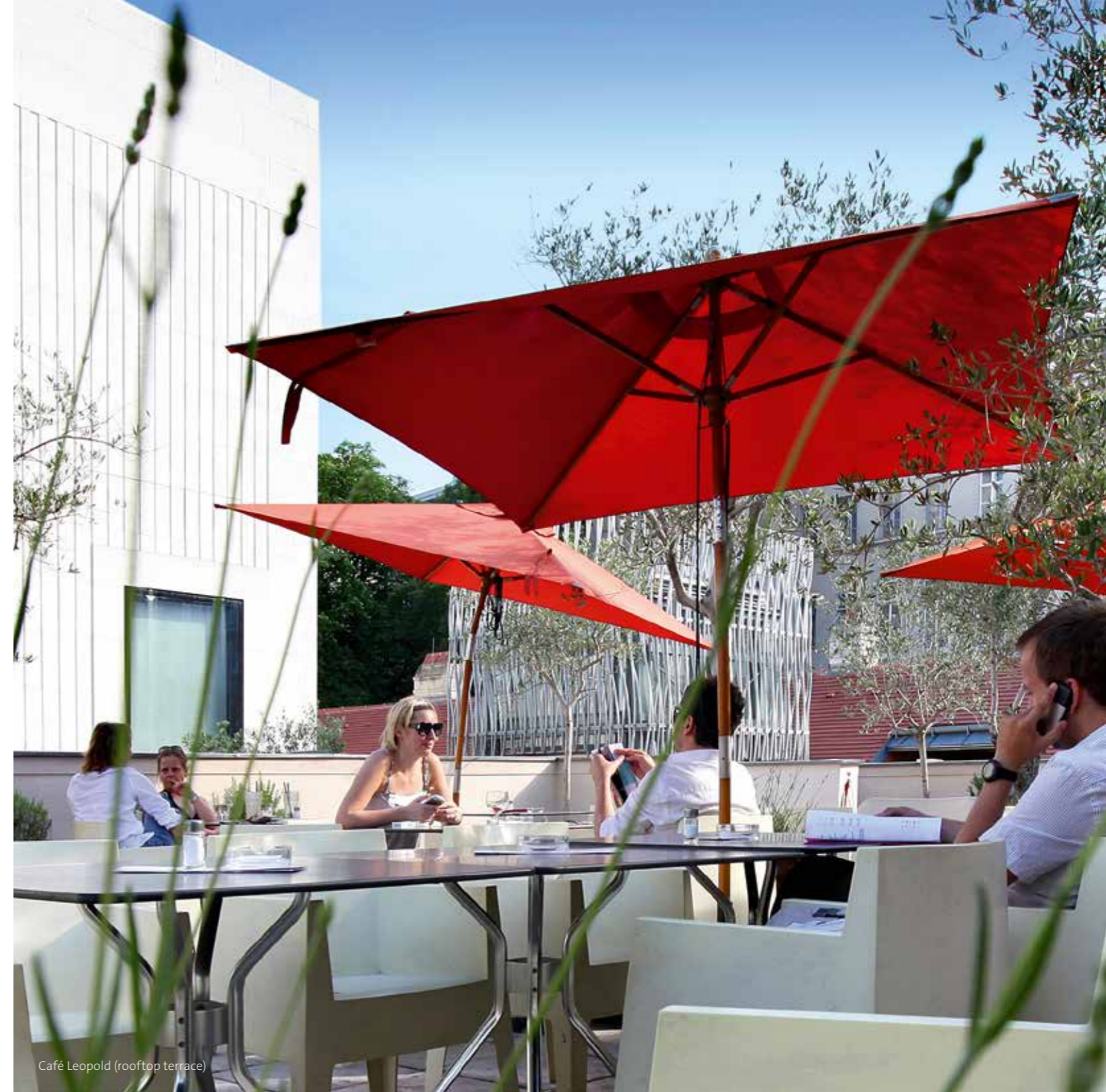
Café Leopold (rooftop terrace)

At the centre of the diverse selection of merchandise available in the shop is a collection designed around the key works of the Leopold Collection , which is rounded out by an international program of classic museums products and specifically Austrian items . All museum visitors are certain to find something beautiful, creative and typically Austrian to take home with them.