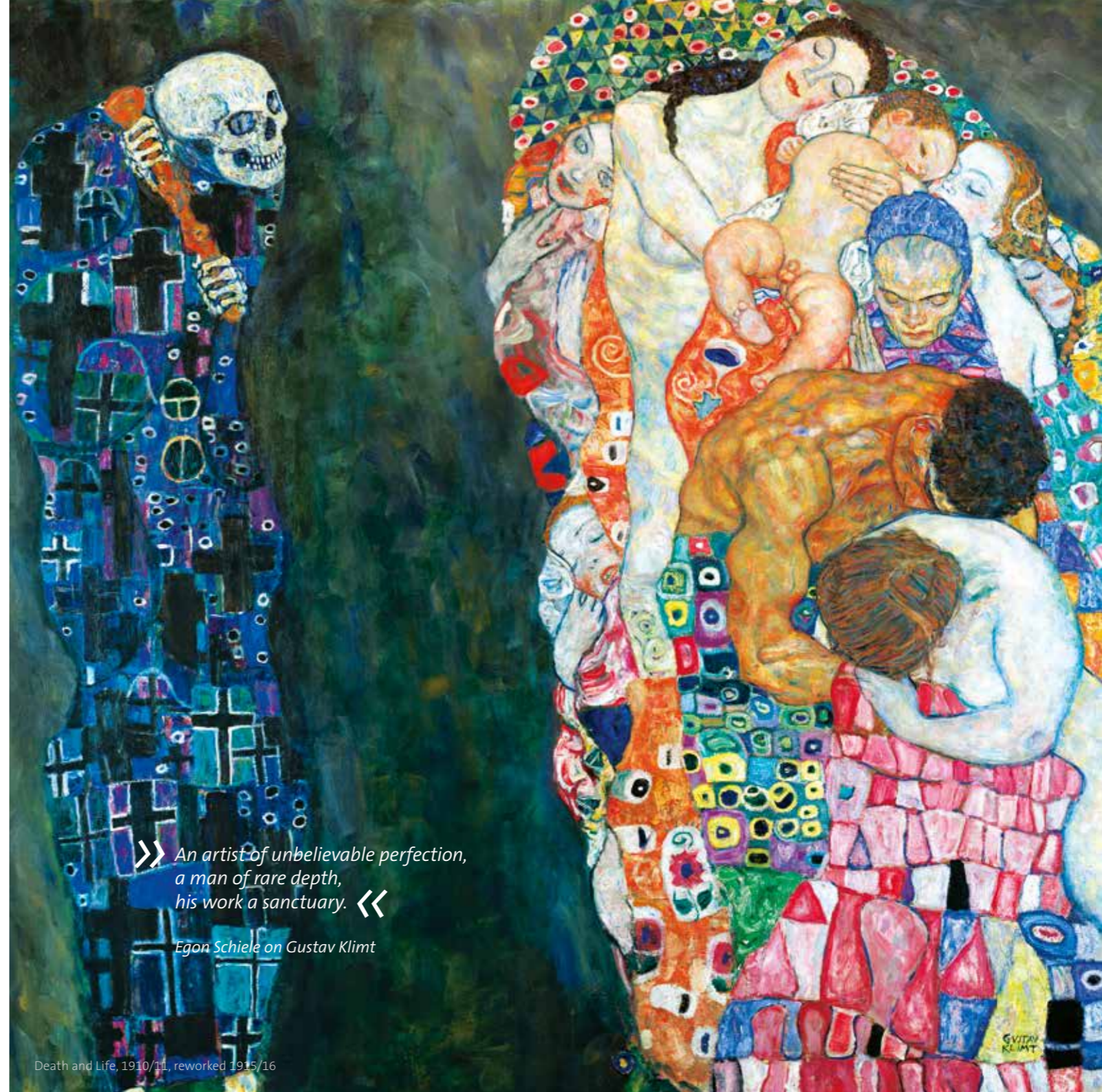
Death and Life, 1910/11, reworked 1915/16

» An artist of unbelievable perfection, a man of rare depth, his work a sanctuary. «