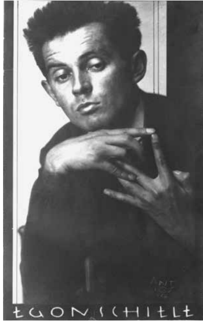
Anton Josef Trčka, Portrait of Egon Schiele, 1914

The world's largest Egon Schiele Collection