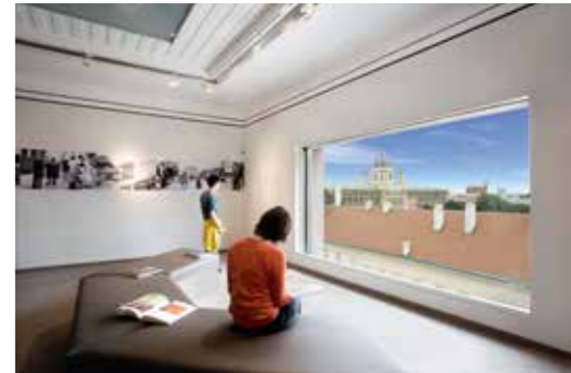
Panorama window on the 4 th level