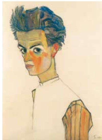
Egon Schiele, Self-Portrait, 1910

RUDOLF LEOPOLD WAS THE FOUNDER OF THE LEOPOLD MUSEUM IN VIENNA. THE STORY OF THE MUSEUM'S DEVELOPMENT COULD HAVE BEEN WRITTEN BY A HOLLYWOOD SCRIPTWRITER.