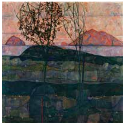
Egon Schiele, Setting Sun, 1913

In addition to a great number of impressive works by Egon Schiele, the Leopold Museum also shows interesting information and original documents pertaining to the life of the artist, who died young in 1918. They shed light on his development from Art Nouveau to Expressionism . Key themes include the way he set himself in scene, death motifs, Schiele's collectors and the role of women in his life and work.