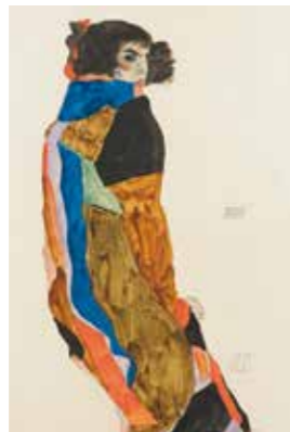
Egon Schiele, Moa, 1911