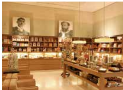
Leopold Museum Shop

At the centre of the diverse selection of merchandise available in the shop is a collection designed around the key works of the Leopold Collection , which is rounded out by an international program of classic museums products and specifically Austrian items . All museum visitors are certain to find something beautiful, creative and typically Austrian to take home with them.