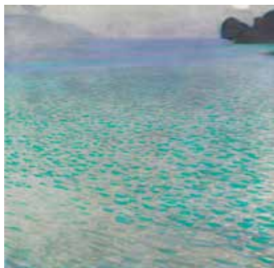
Gustav Klimt, On Lake Attersee, 1900