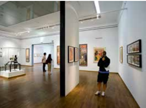
View of the exhibition »Vienna 1900«