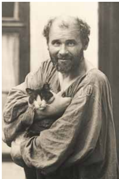
Gustav Klimt with Cat, 1912

THE LEOPOLD MUSEUM SHOWS SEVERAL KEY MASTERPIECES BY SECESSION FOUNDER GUSTAV KLIMT, INCLUDING DEATH AND LIFE , ATTERSEE AND STILL POND .