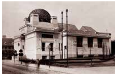
The Vienna Secession building shortly after its completion, 1898