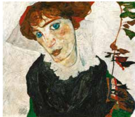
Egon Schiele, Portrait Wally Neuzil, 1912